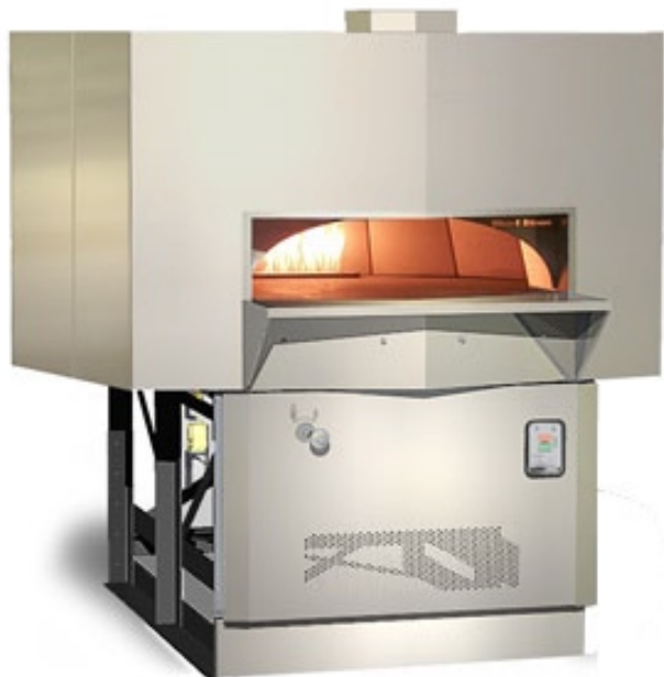
Oven shown with optional stainless steel mantle.