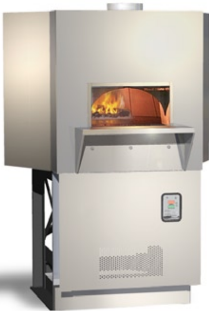
Oven shown with optional stainless steel mantle.