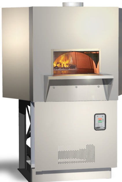
Oven shown with optional stainless steel mantle.